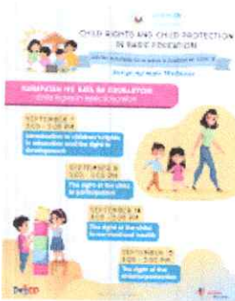
Child Rights in Education Poster.png 570K