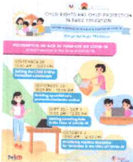
Child Protection in the time of COVID-19 Poster.png 581K