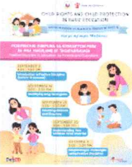
Positive Discipline for Parents and Guardians Poster.png 1064K