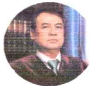
CHIEF JUSTICE ALEXANDER G. GESMUNDO Supreme Court Keynote Speaker