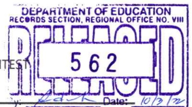
EXHIBIT LEARNERS POSTER MAKING CONTEST CLMD-ESF

To be indicated in the Perpetual Index under the following subjects: