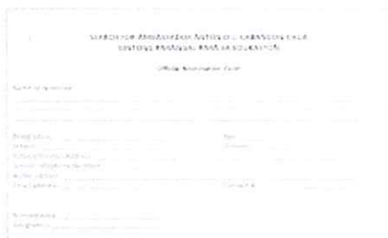
NOMINATION FORM.png 28K