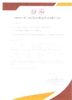
S4HH 2025 Letters-2.png 298K