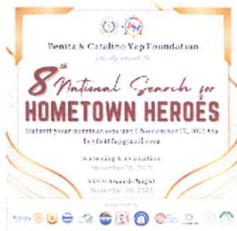
BCYF Announcements 1-10.png 319K