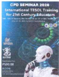
CPD Tesol poster.jpg 184K