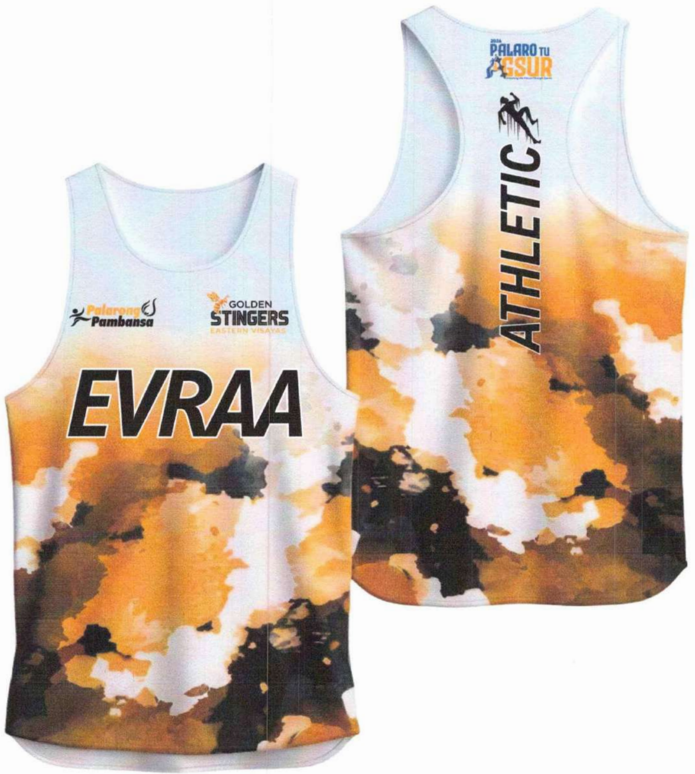
ATHLETIC'S UNIFORM & WRESTLING