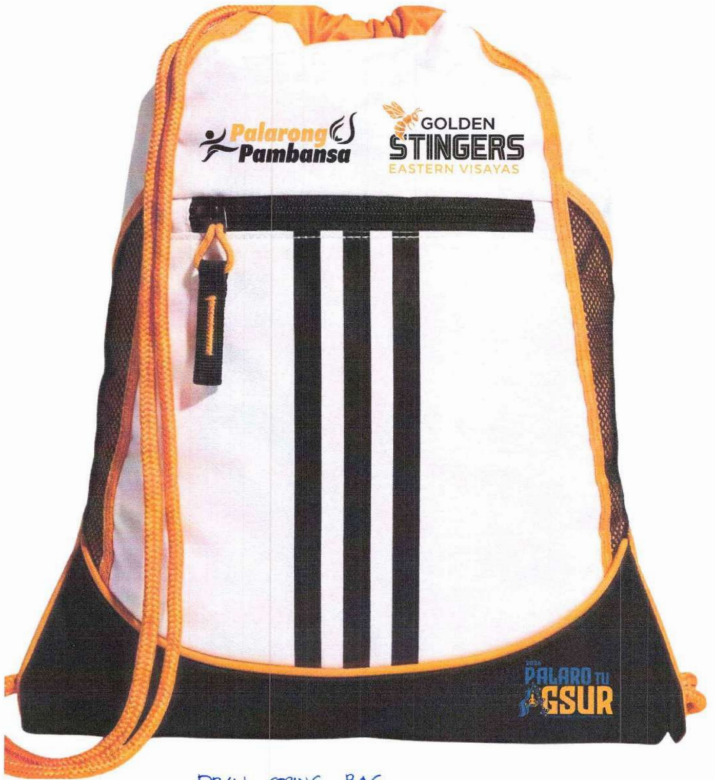
DRAW STRING BAG