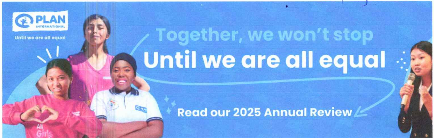
English Campaign Tag

Any opinions expressed in this message and any attachments are those of the sender only and do not necessarily represent the views of Plan. Internet communications are not secure and Plan accepts no responsibility for the content of this e-mail.